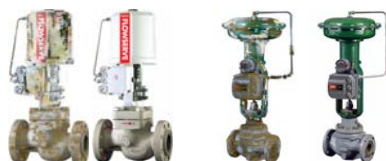
Sample Before and After Photographs

ECI provides only factory-trained and certified repair technicians